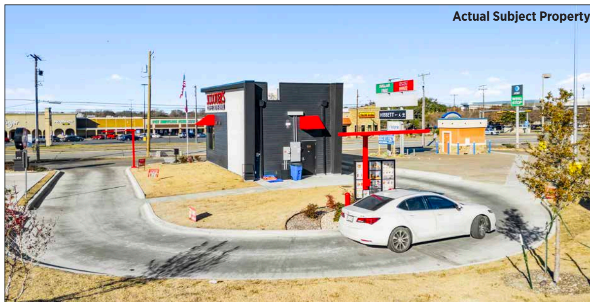
Actual Subject Property