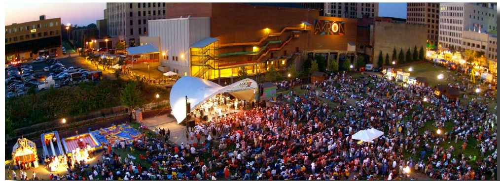
LOCK 3 PARK