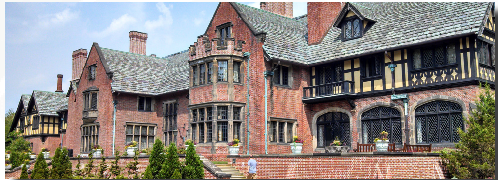
STAN HYWET HALL & GARDENS