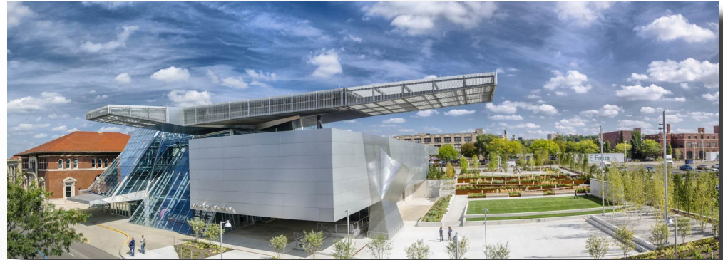
AKRON ART MUSEUM

Situated in downtown Akron, Lock 3 is an affordable, family-friendly entertainment area. Several events take place in Lock 3 each year. During the summer, the amphitheater hosts WONE's Rock the Lock concerts which feature the best acts in the country. During the winter, Lock 3 kicks off every year with the Downtown Holiday Lighting Ceremony by exploding the night sky with fireworks. Since its opening in 2003, the park has hosted over 2 million visitors.