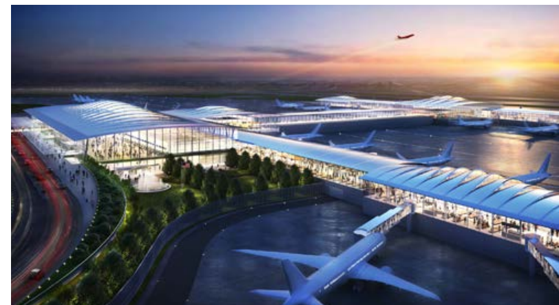
KANSAS CITY INTERNATIONAL AIRPORT

1,734 Jobs Created at Urban Outfitters Distribution Center