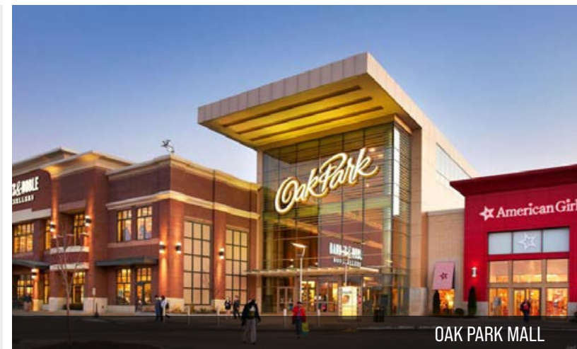
OAK PARK MALL

"Best Cities to Live in America" by Niche (2021)