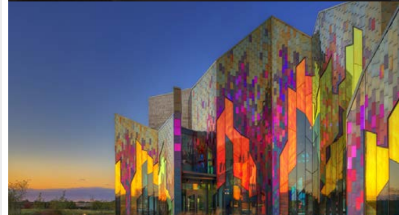
MUSEUM AT PRAIRIEFIRE