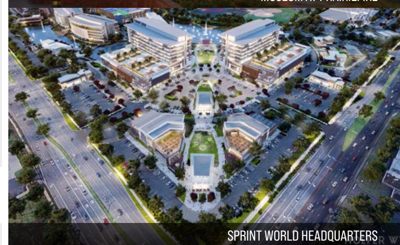
SPRINT WORLD HEADQUARTERS