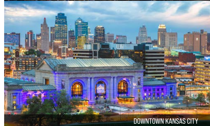
DOWNTOWN KANSAS CITY