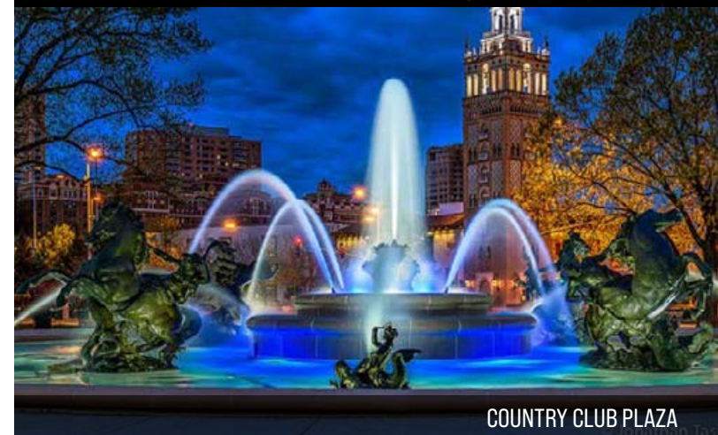
COUNTRY CLUB PLAZA