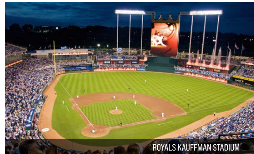
ROYALS KAUFFMAN STADIUM