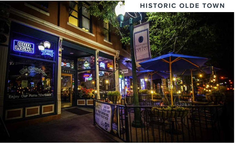
HISTORIC OLDE TOWN