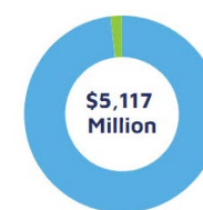
FY21 Adjusted Operating Income* ● United States ● International