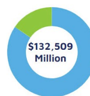
FY21 Sales ● United States ● International