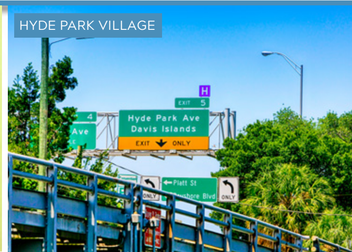
HYDE PARK VILLAGE