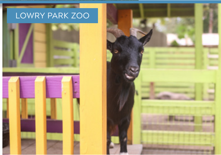
LOWRY PARK ZOO