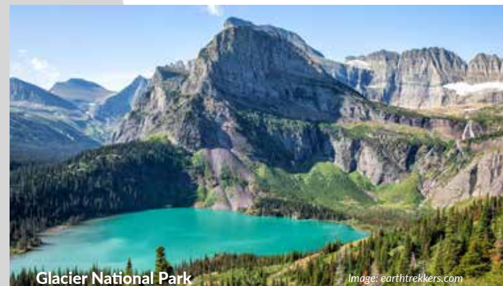
Glacier National Park