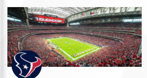
HOUSTON TEXANS (National Football League)