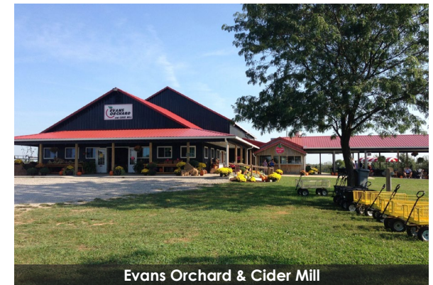
Evans Orchard & Cider Mill