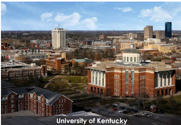
University of Kentucky