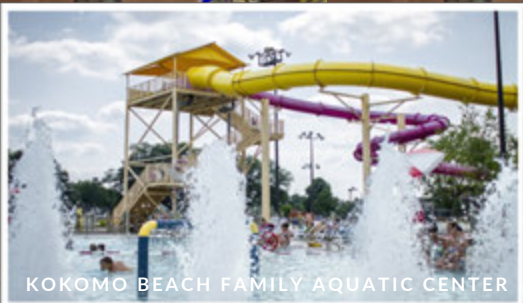
KOKOMO BEACH FAMILY AQUATIC CENTER

From historical museums, art glass tours, and roadside attractions, the Kokomo area offers a large variety of sights to see. The museums of the city provide interesting and informative experiences to visitors of Kokomo. The residents of Kokomo celebrate several festivals annually, some of which are the Haynes Apperson Festival, Oktoberfest, Rib Fest and Strawberry Festival. Nearby attractions of the City include Elwood Haynes Museumm, Automotive Heritage Museum Howard County Historical Museum, American Legion Golf Course, Kokomo Country Club and Foster Park. Indianapolis is home to two major sports clubs, the Indiana Pacers of the National Basketball Association and the Indianapolis Colts of the National Football League. Indianapolis is headquarters for the American Legion, and home to a significant collection of monuments dedicated to veterans and war dead, the most in the U.S. outside of Washington, D.C.