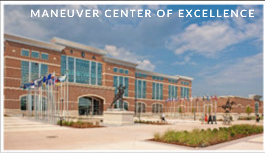
MANEUVER CENTER OF EXCELLENCE

Columbus offers its visitors and residents a wide variety of fine attractions. The Port Columbus Civil War Naval Museum, the nation's only Civil War naval museum, is a living structure which chronicles the Civil War era. The National Infantry Museum contains a large collection of military art and artifacts and focus on the role of the American Infantryman through two centuries of valor. Some of the other notable attractions in the city include the following: Coca-Cola Space Science Center: Includes replicas of an Apollo capsule and Space Shuttle, Heritage Corner, Andersonville: The former Camp Sumter, Little Whitehouse: Built by future President Franklin D. Roosevelt in 1932 while governor of New York, F.D. Roosevelt State Park, Warm Springs Village, Westville, Springer Opera House, Callaway Gardens, Columbus Museum, Oxbow Meadows, Pine Mountain Wild Animal Safari, Providence Canyon. Columbus is home to two professional sports teams. The Columbus Catfish are a Class A minor league baseball team playing in the South Atlantic League. The Catfish are affiliated with Major League Baseball's Tampa Bay Devil Rays.