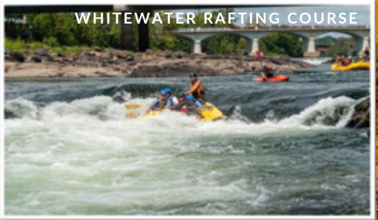
WHITewater RAFTING COURSE