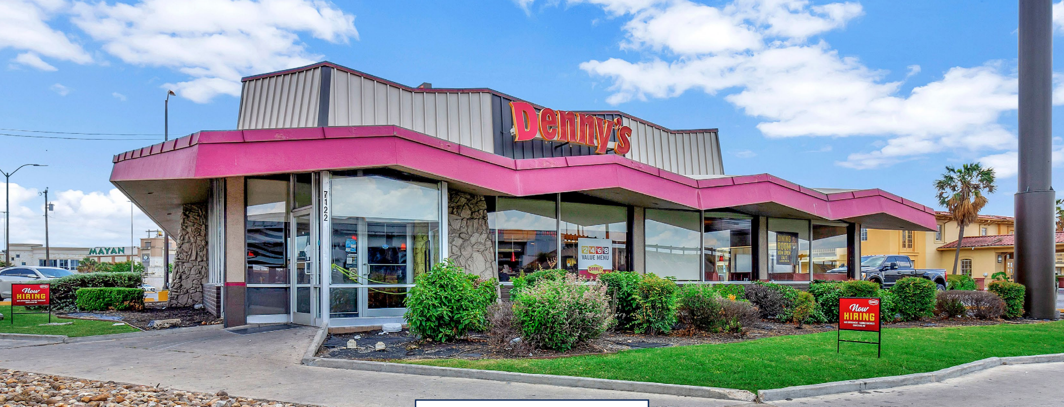
ACTUAL SITE | PHOTOS TAKEN JUNE 2021