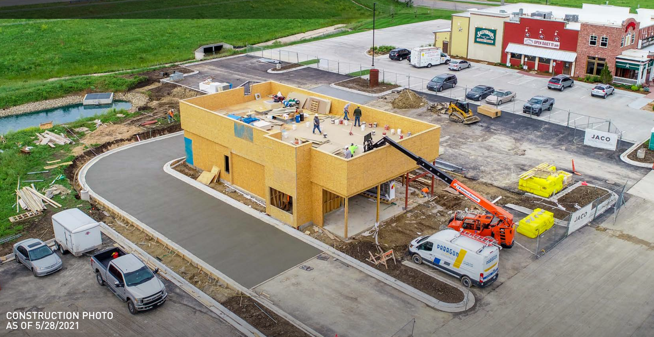
CONSTRUCTION PHOTO AS OF 5/28/2021

2608 NORTH GREENWICH COURT, WICHITA, KANSAS