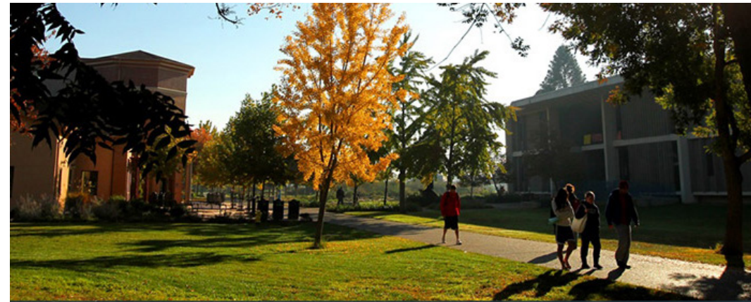
California State University, Stanislaus

California State University, Stanislaus serves a diverse student body of more than 16,000 at two locations in the Central Valley — a beautiful 228-acre campus in Turlock and the Stockton Campus, located in the city's historic Magnolia District. Widely recognized for its dedicated faculty and high-quality academic programs, the University offers 43 majors, 41 minors and more than 100 areas of concentration, along with 16 master's degree programs, 7 credential programs and a doctorate in educational leadership. The University opened as Stanislaus State College in 1960, with a faculty of 15 and fewer than 800 students, at the Stanislaus County Fairgrounds in Turlock. The institution moved to its current location in 1965, gained university status and its present name in 1986, and opened its Stockton Campus in 1998. Stanislaus State is part of the California State University, a 23-campus system across California. With more than 400,000 students, it is the largest, the most diverse, and one of the most affordable university systems in the country. CSU campuses emphasize access to quality public higher education and workforce preparation that is responsive to regional needs.