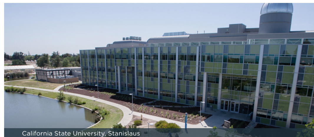
California State University, Stanislaus