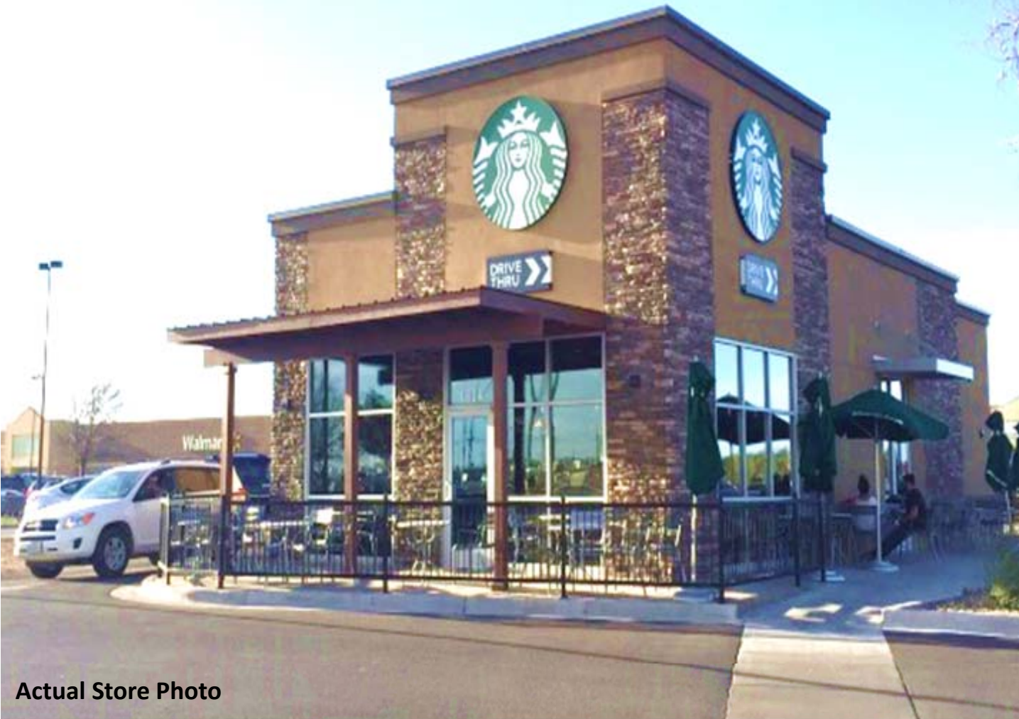
Actual Store Photo

1824 West Joe Harvey Blvd. Hobbs, NM 88240