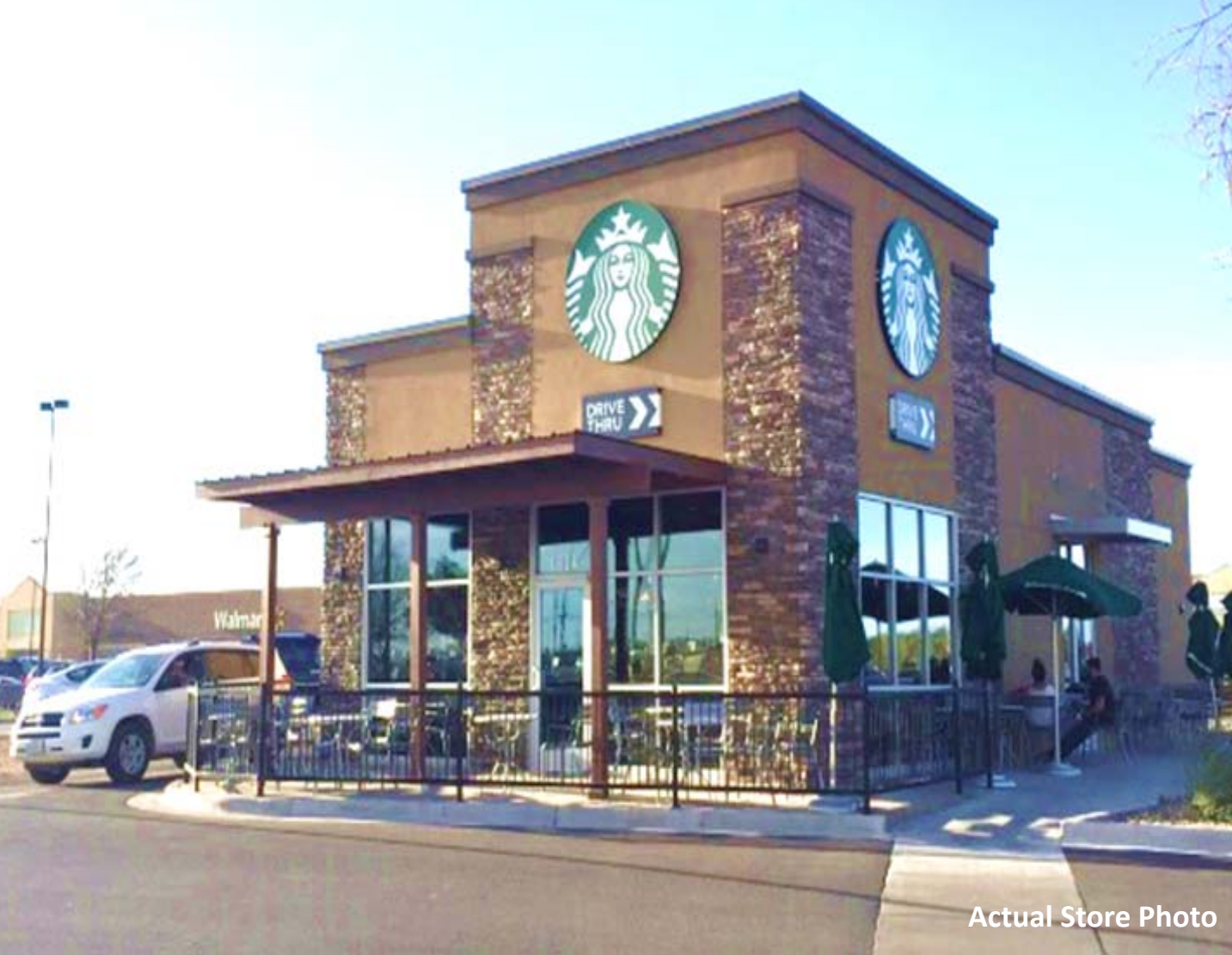
Actual Store Photo