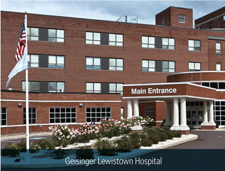
Geisinger Lewistown Hospital