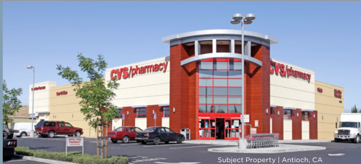
Subject Property | Antioch, CA