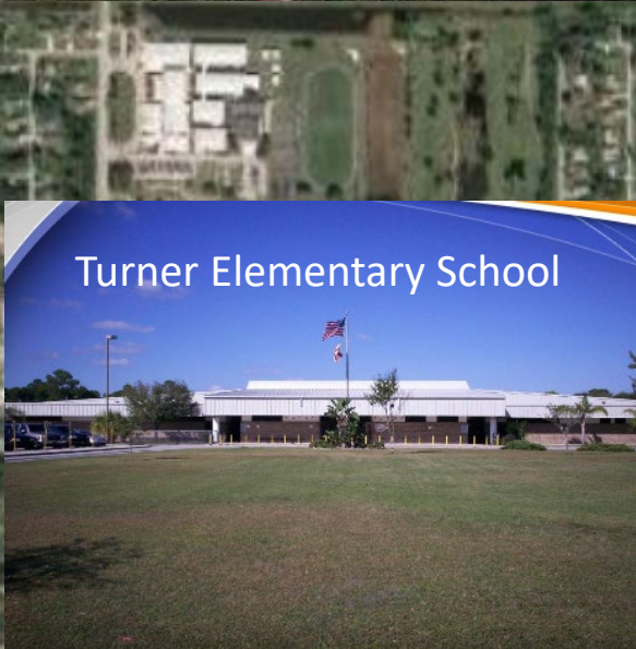
Turner Elementary School