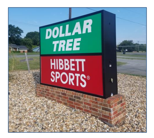
1500 S. Main St. Lindale, TX

The information contained herein was obtained from sources believed to be reliable; however, Burns Commercial Properties makes no guarantees, warranties, or representations as to completeness or accuracy thereof. The presentation of this property for sale, rent, or exchange is subject to errors, omissions, change of price or conditions of prior sale or lease, or withdrawal without notice.