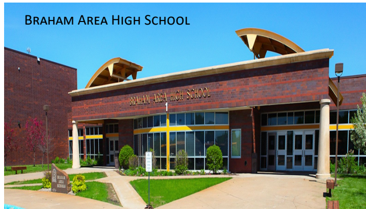
BRAHAM AREA HIGH SCHOOL