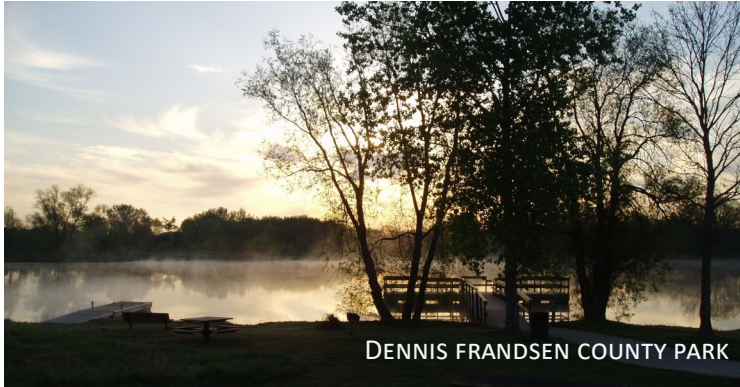
DENNIS FRANDSEN COUNTY PARK

This Sinclair Branded Convenience Store is located on Main Avenue North in Braham, Minnesota. Traffic counts average 4,900 vehicles daily on Main Avenue South. Sinclair is across the street from Home Town Liquor Store, and one block north of Central Drive with retailers Subway, Braham Lane's, Braham Custom Meat & Retail, Tusen Tack, Frandsen Bank & Trust, Mike's Discount Foods, USPS, and more. Sinclair is one block south of East Central Energy, and less than a mile north of Braham Area High School. Braham is a city in Isanti and Kanabec counties in Minnesota. Braham is located 12 miles north of Cambridge, 15 miles southwest of Pine City, 16 miles south-southeast of Mora, and 12 miles west of Rush City. Braham is the homemade pie capital of Minnesota.