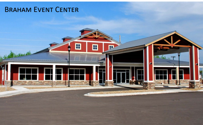
BRAHAM EVENT CENTER

Braham lies 55 miles north from the Twin-cities Metro Area. Known as the Twin-Cities, the Minneapolis-St. Paul MSA is the 16th largest metropolitan area in the U.S., with approximately 3.4 million residents. The Twin Cities metro area is home to 19 fortune 500 companies, including Target, 3M, Medtronic, General Mills, Xcel Energy, Ameriprise Financial, and Land O' Lakes. There are also many large private companies, including Cargill and Schwan Foods. Minneapolis and St. Paul are home to many professional sports teams, which draws fans from across the Midwest region. The metro area is also home to many institutions of higher education, most notably the University of Minnesota, which has a current enrollment over 51,000 students, making it one of the top 10 largest universities in the country.