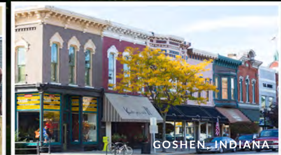
ELKHART COUNTY COURTHOUSE