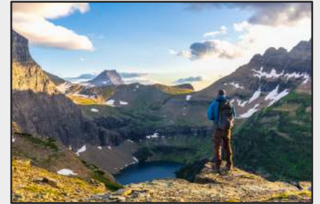
Glacier National Park