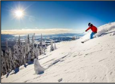
Whitefish Mountain Resort