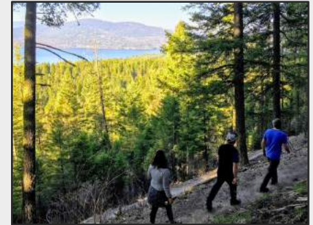
The Whitefish Trail