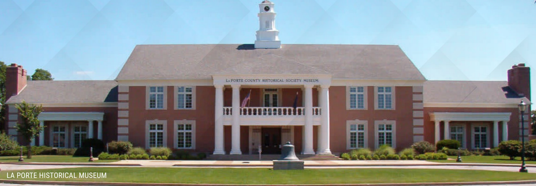
LA PORTE HISTORICAL MUSEUM