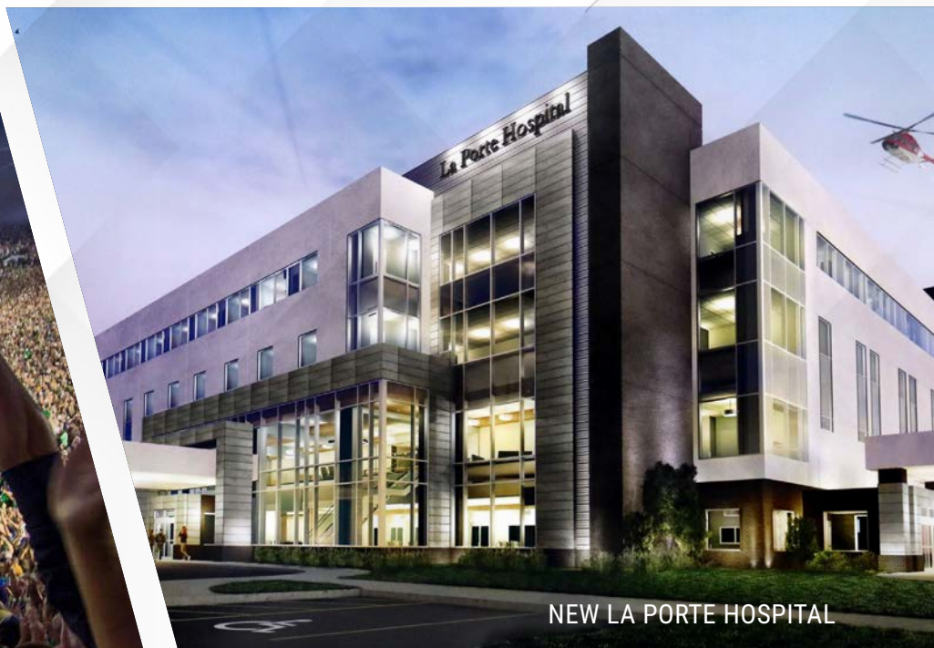
NEW LA PORTE HOSPITAL