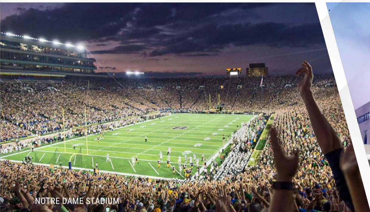
NOTRE DAME STADIUM