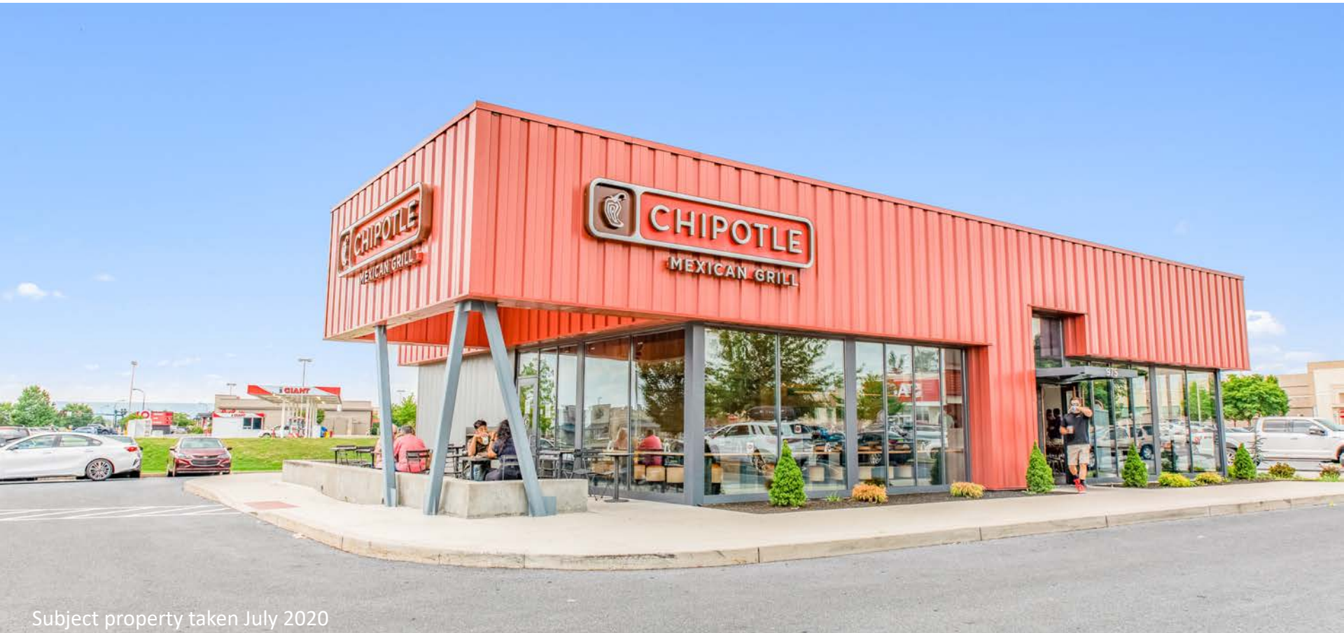
Subject property taken July 2020