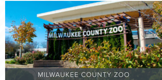
MILWAUKEE COUNTY ZOO

Once home to Captain Frederick Pabst, founder of the Pabst Brewing Company, Pabst Mansion is a house museum that preserves the legacy of the Pabst family. In 1979, the mansion was placed on the National Register of Historic Places.