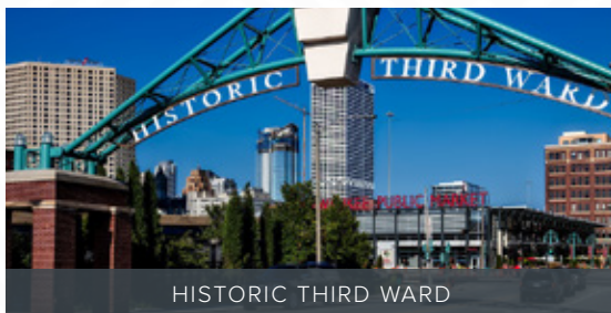
HISTORIC THIRD WARD

Spanning 200 wooded acres, the Milwaukee County Zoo houses over 2,000 mammals, birds, fish, amphibians and reptiles in specialized habitats. The zoo's objective is to inspire public support and participation in global conservation of animal species.