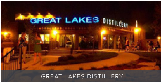
GREAT LAKES DISTILLERY

Named after the Miller Brewing Company, Miller Park is the homefield of the Milwaukee Brewers. The grand, brick structure is one of the largest construction projects in Wisconsin history with an impressive retractable roof.