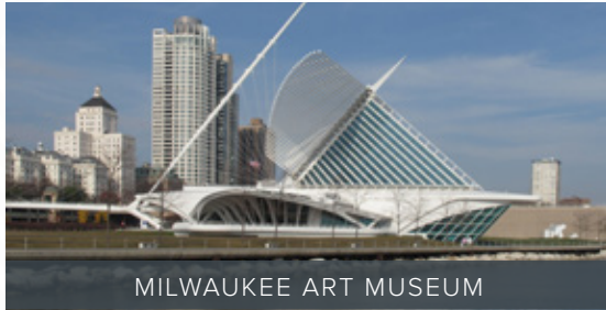
MILWAUKEE ART MUSEUM

From its origins in Milwaukee's first art gallery, the Milwaukee Art Museum has become an icon for the city. It is one of the largest museums in the country, showcasing 30,000 works of art to over 400,000 visitors a year.