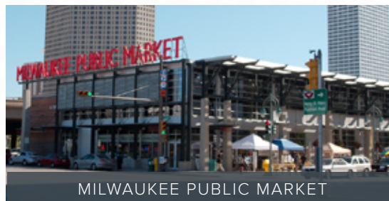
MILWAUKEE PUBLIC MARKET

Three blocks south of downtown Milwaukee, the Historic Third Ward is known as Milwaukee's Arts and Fashion District. The area offers the city's most dynamic array of restaurants, spas, theaters, galleries and shopping, all in a historic warehouse setting.