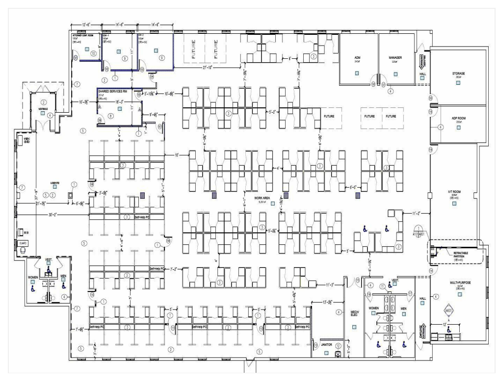
New Floorplan - 411 Garden