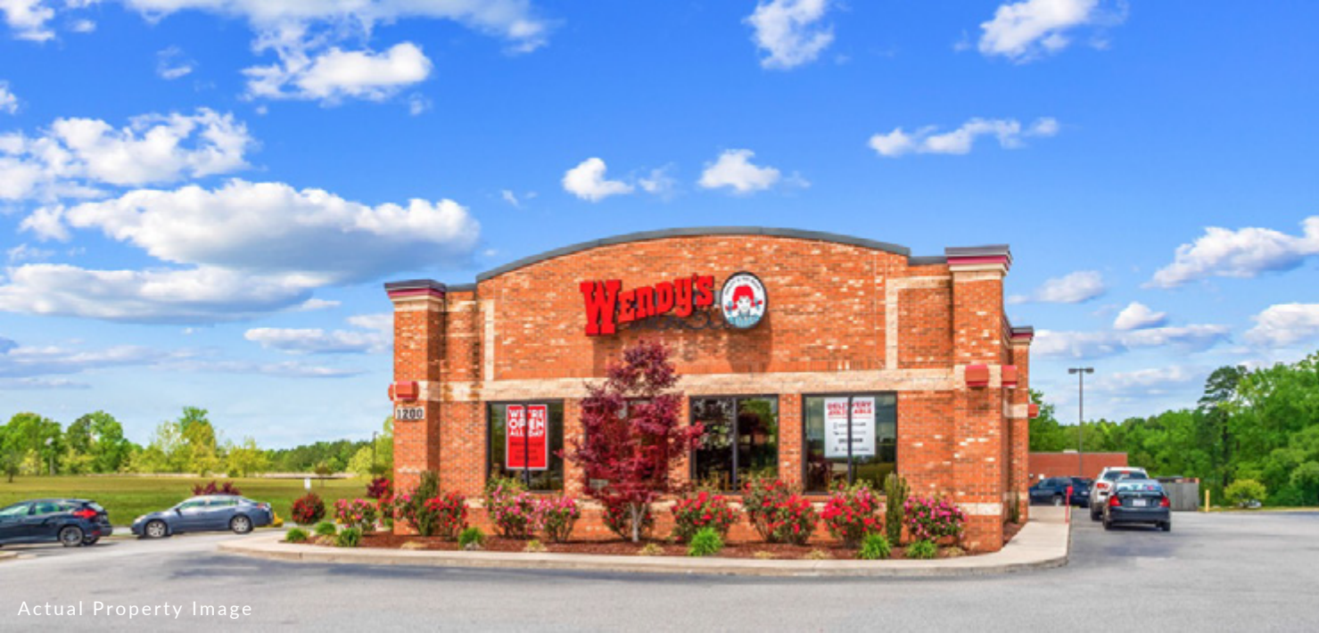
Actual Property Image