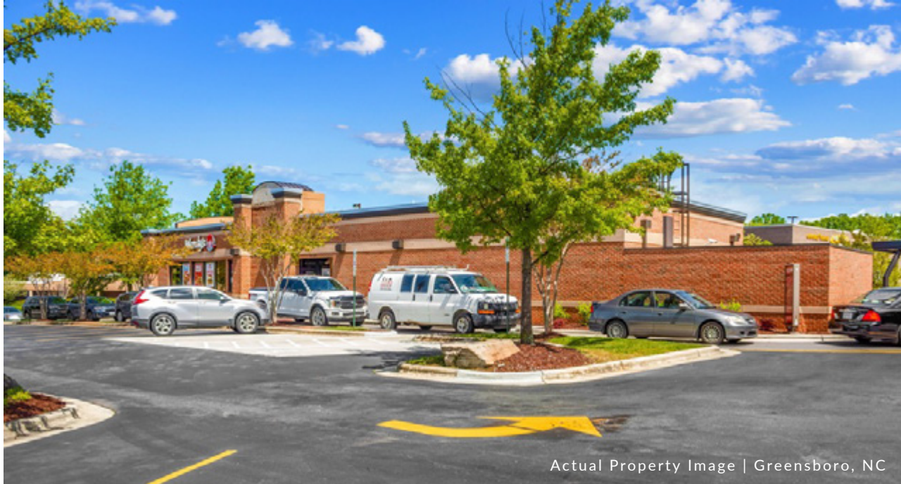
Actual Property Image | Greensboro, NC