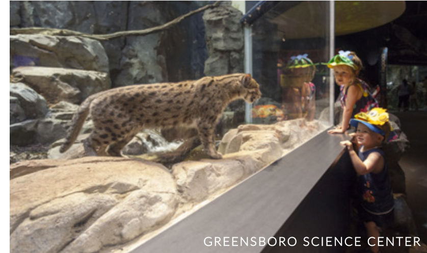
GREENSBORO SCIENCE CENTER

The Greensboro economy and the surrounding Piedmont Triad area center around textiles, tobacco, and furniture. Greensboro's central proximity in the state has made it a popular place for families and businesses, as well as becoming more of a logistics hub, with FedEx having regional operations based in the city. Notable companies headquartered in Greensboro include the Honda Aircraft, ITG Brands Kayser-Roth, VF, Mack Trucks, The Biscuitville, TIMCO, and Wrangler. The University of North Carolina at Greensboro and North Carolina A&T State University opened a joint research park called Gateway University Research Park.