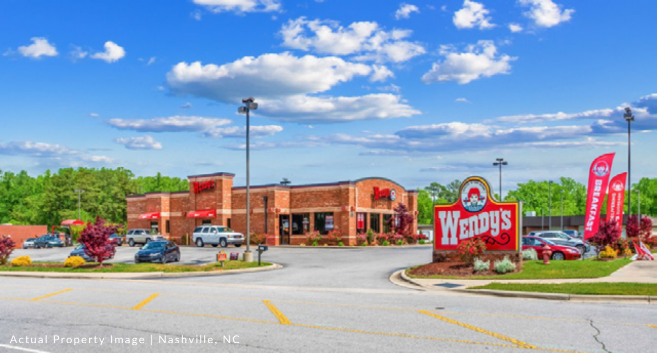
Actual Property Image | Nashville, NC