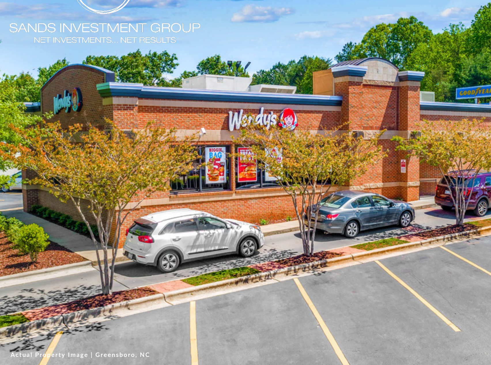
Actual Property Image | Greensboro, NC

SANDS INVESTMENT GROUP NET INVESTMENTS... NET RESULTS