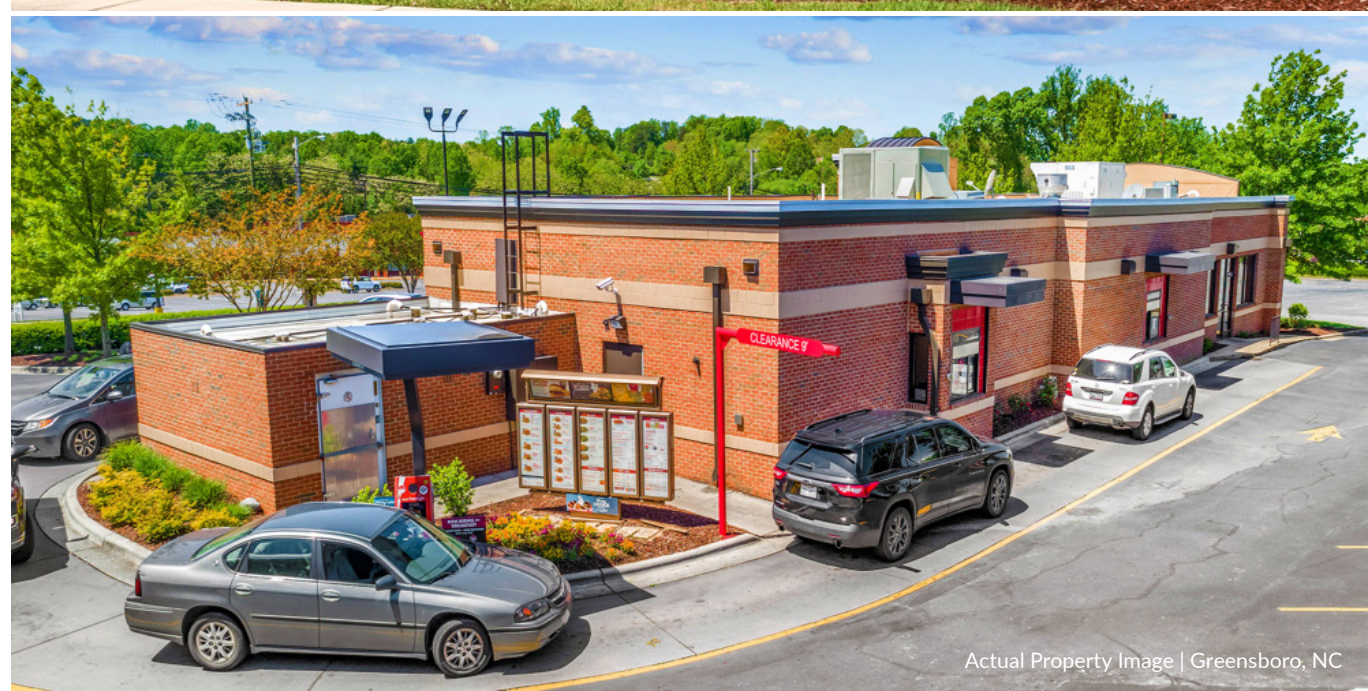
Actual Property Image | Greensboro, NC