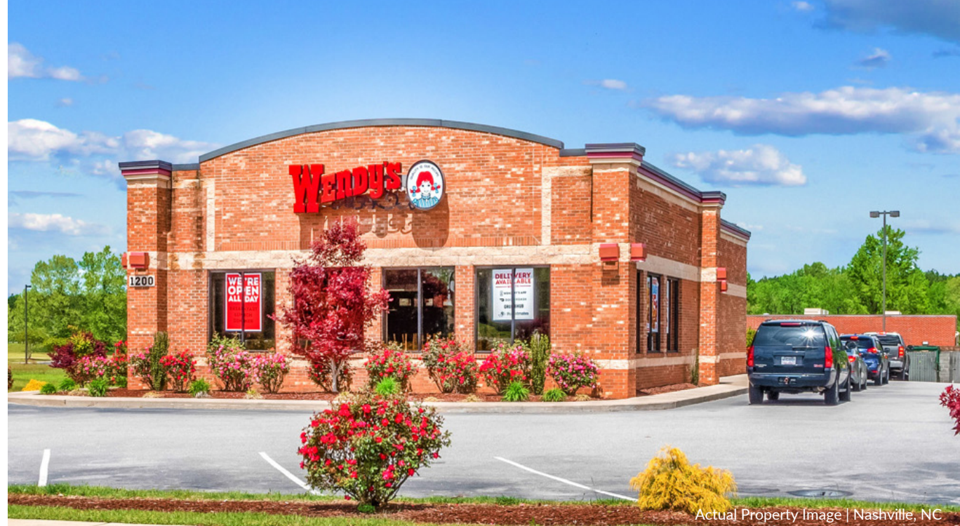
Actual Property Image | Nashville, NC