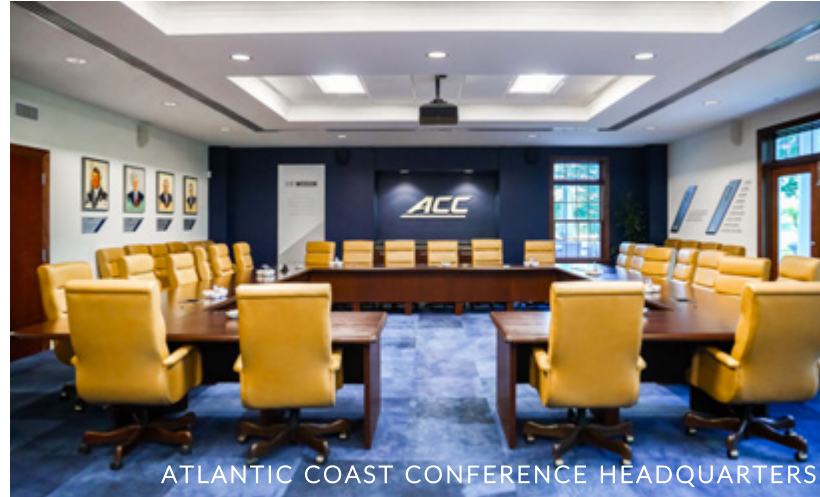
ATLANTIC COAST CONFERENCE HEADQUARTERS

Greensboro is a city in the U.S. state of North Carolina. It is the 3rd-most populous city in North Carolina and the 68th-most populous city in the United States. It is the county seat and largest city in Guilford County and the surrounding Piedmont Triad metropolitan region. As of the 2018 the estimated population was 294,722 residents Three major interstate highways (Interstate 40, Interstate 85, and Interstate 73) in the Piedmont region of central North Carolina were built to intersect at this city. Downtown Greensboro has an active nightlife with numerous nightclubs, bars and restaurants. The city is home to the Atlantic Coast Conference.