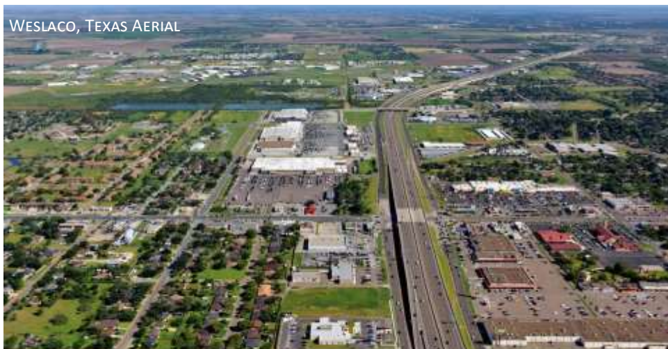
WESLACO, TEXAS AERIAL

This Dollar General is located off of Mile 5 Road West, in Weslaco, Texas. Traffic counts average over 21,000 vehicles daily on Mile 5 Road West. Located near the property is the Beatriz Garza Middle School and the North Bridge Elementary School.