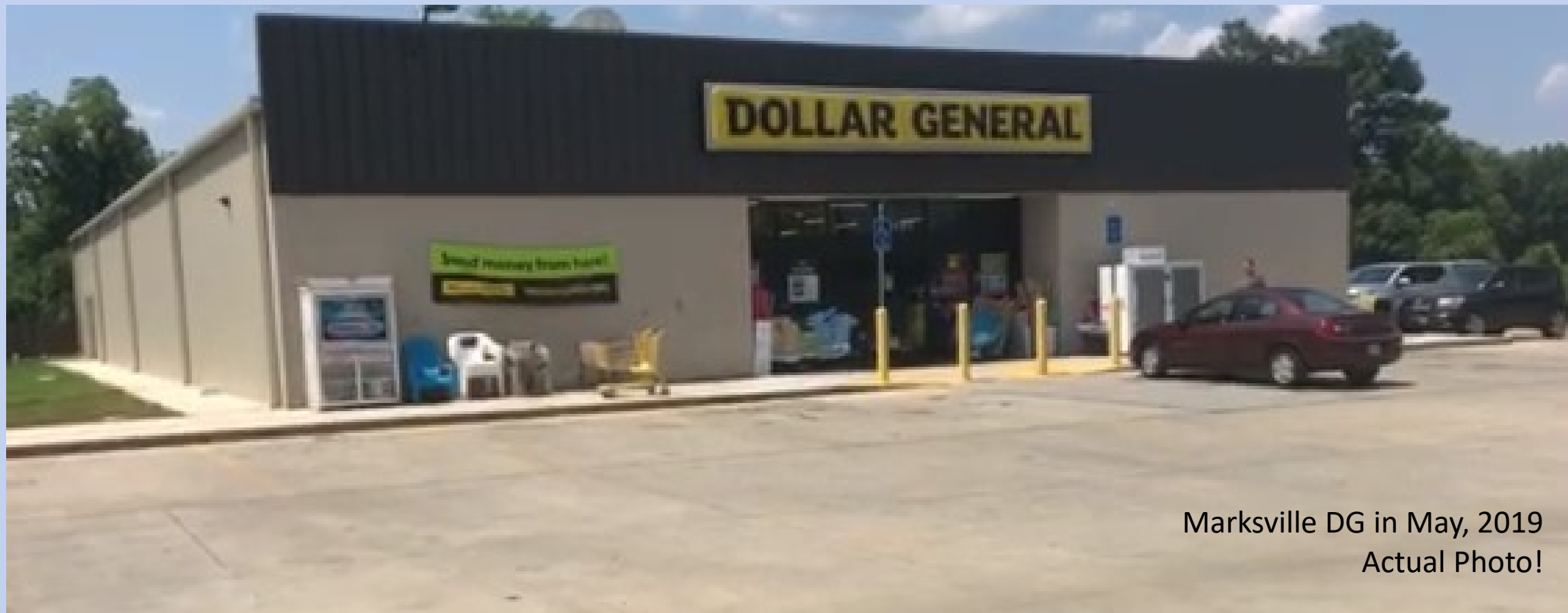
Marksville DG in May, 2019 Actual Photo!