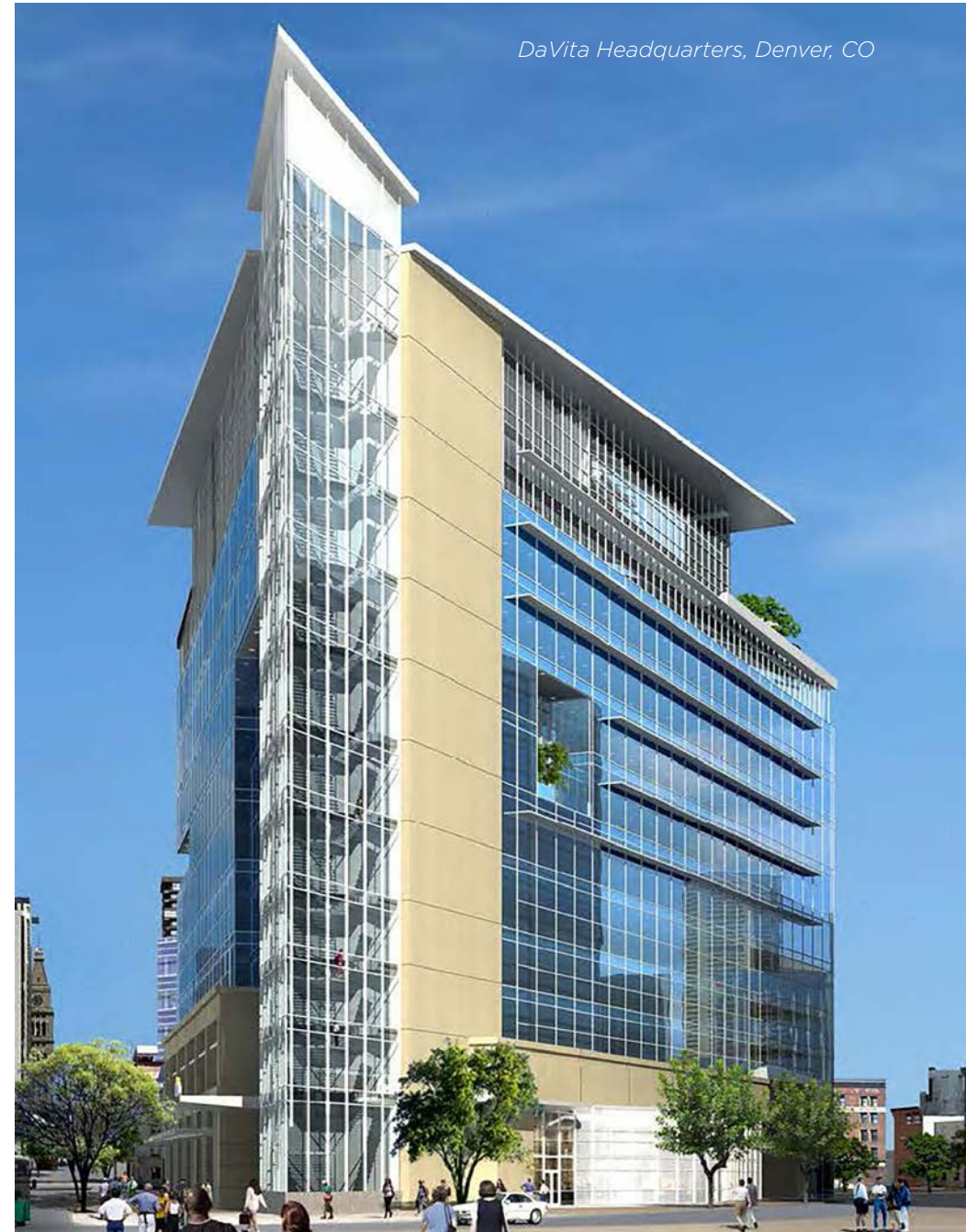
DaVita Headquarters, Denver, CO

More information can be obtained at www.davita.com