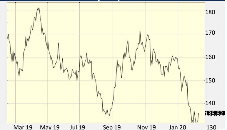
Advance Auto Parts Historical Growth Chart Stock Growth Trajectory - Mar 19 to Jan 20

For more information, please visit https://shop.advanceautoparts.com/