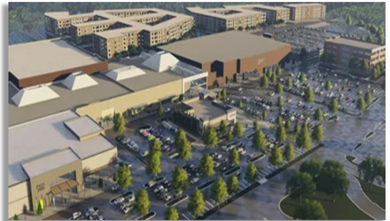
A rendering of the new proposed revisions to Monmouth Mall.