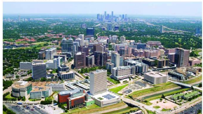
Houston Medical Center

Galveston Bay and the Buffalo Bayou together form one of the most important shipping hubs in the world, and the Port of Houston, the Port of Texas City, and the Port of Galveston are all major seaports located in Greater Houston. The Port of Houston ranks 1st in the U.S. in international waterborne tonnage handled and 2nd in total cargo tonnage handled. The area is one of the leading centers of the energy industry, particularly petroleum processing, and many companies have large operations in this region. The MSA comprises the largest petrochemical manufacturing area in the world, including for synthetic rubber, insecticides, and fertilizers. Much of metro area's success as a petrochemical complex is enabled by the Houston Ship Channel. The area is also the world's leading center for building oilfield equipment, and is a major center of biomedical research, aeronautics, and high-technology.