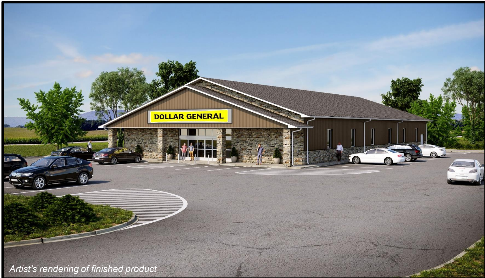
Artist's rendering of finished product

New 15-Year Lease • Full Triple Net (NNN) • Brand New Construction