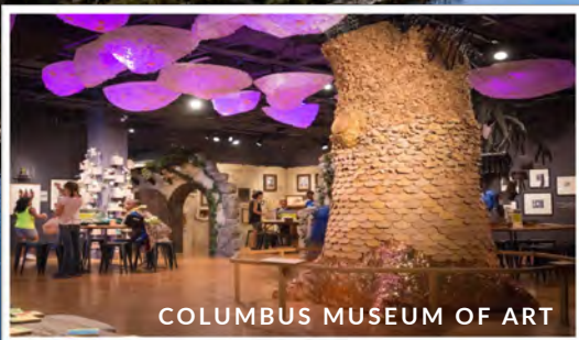
COLUMBUS MUSEUM OF ART