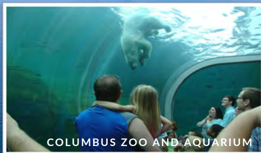
COLUMBUS ZOO AND AQUARIUM