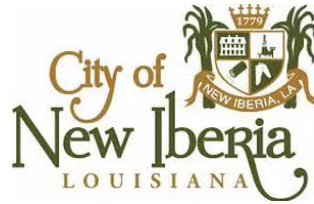
Downtown New Iberia

New Iberia is renowned for its unique culture and cuisine, which draw from the melting pot of its Spanish-French-African American-Creole heritage. Spaniards led by Francisco Bouligny founded the town in 1779 on the banks of the Bayou Teche. The area was then settled by Acadians (French immigrants who came to be called Cajuns) who were exiled by British troops from Nova Scotia, Canada and eventually made their way as refugees to Louisiana.