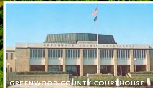
GREENWOOD COUNTY COURTHOUSE

Every year in June, Greenwood hosts the South Carolina "Festival of Flowers". The festival was originally started in 1968 as an outgrowth of Park Seed Corporation's annual Grower Days, and Park Seed remains a major sponsor of the festival. The Festival has also included jazz concerts, Cessna flights for children, world food, a showcase for classic cars, and even a dog show. There is also a medical symposium, hosted by Self Regional Healthcare during the festival. This event draws many gardening enthusiasts from around the nation. The second weekend in July, the Uptown Greenwood Development Corporation hosts the South Carolina "Festival of Discovery." This is a weekend of food, fun, music, and much more as you experience and learn about the history, traditions, folklore, arts and crafts, music and dance, and vernacular of Greenwood and the South Carolina Upstate area. The festival includes a Kansas City Barbeque Society sanctioned and South Carolina State Championship cook-off featuring some the best BBQ teams in the country. In addition, the Festival honors the Greenwood cooking tradition of black kettle hash. Also celebrated during the weekend is the rich sound of and tradition of the blues. The Greenwood Blues Cruise features Blues music at seven different venues in the downtown area.