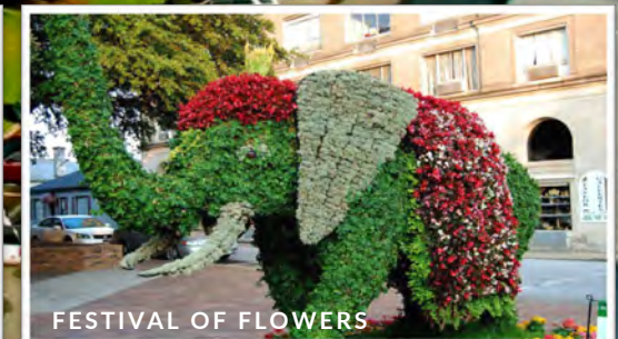
FESTIVAL OF FLOWERS