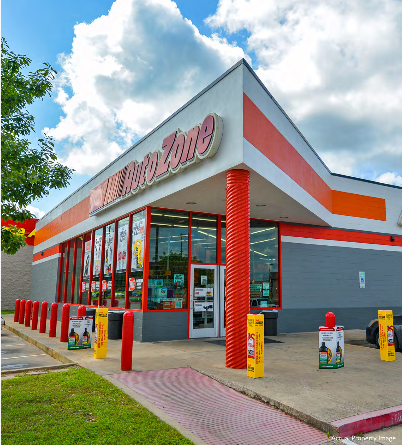
Actual Property Image