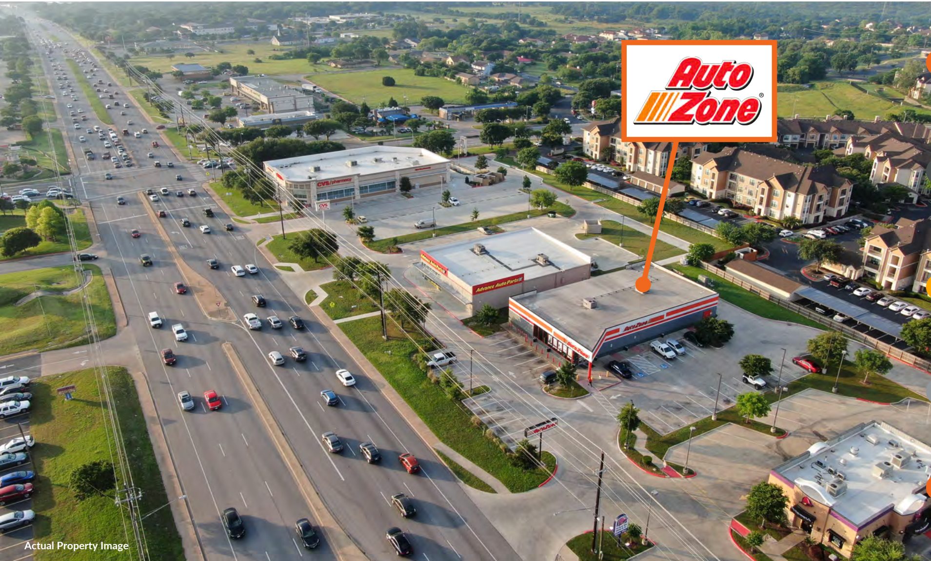
Actual Property Image