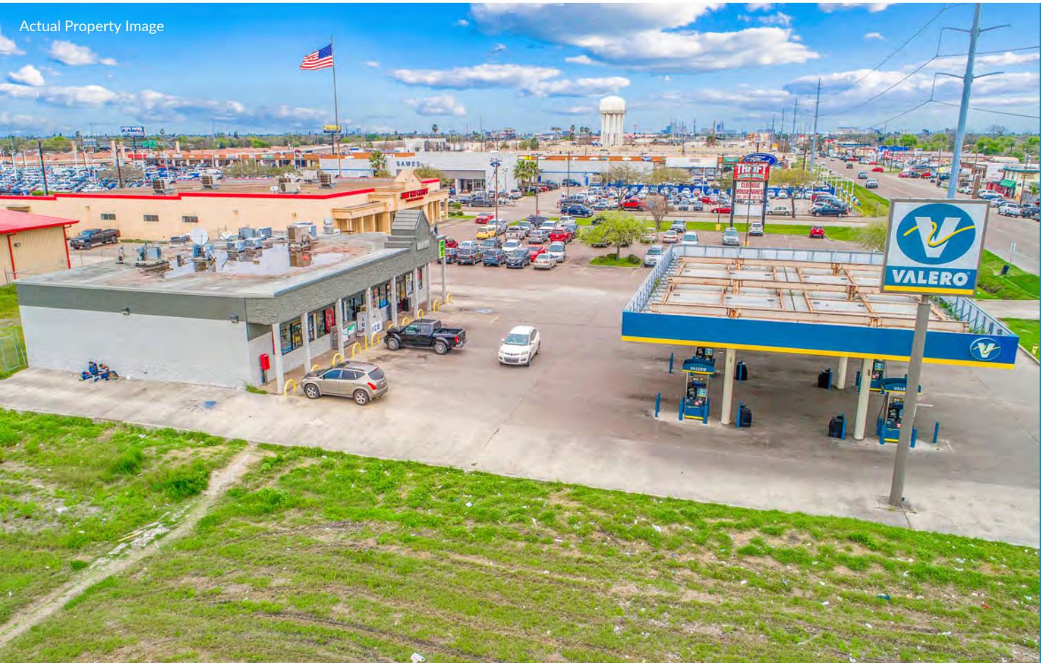
Actual Property Image

Sands Investment Group is Pleased to Exclusively Offer For Sale the 3,993 SF Valero Located at 4817 Ayers Street in Corpus Christi, Texas. This Brand New 20 Year Absolute Triple Net (NNN) Lease with Zero Landlord Responsibilities and Rent Increases Every Five Years, Provides For a Secure Stable Income Stream. Well Established Guarantor Currently Operating 26 Locations.