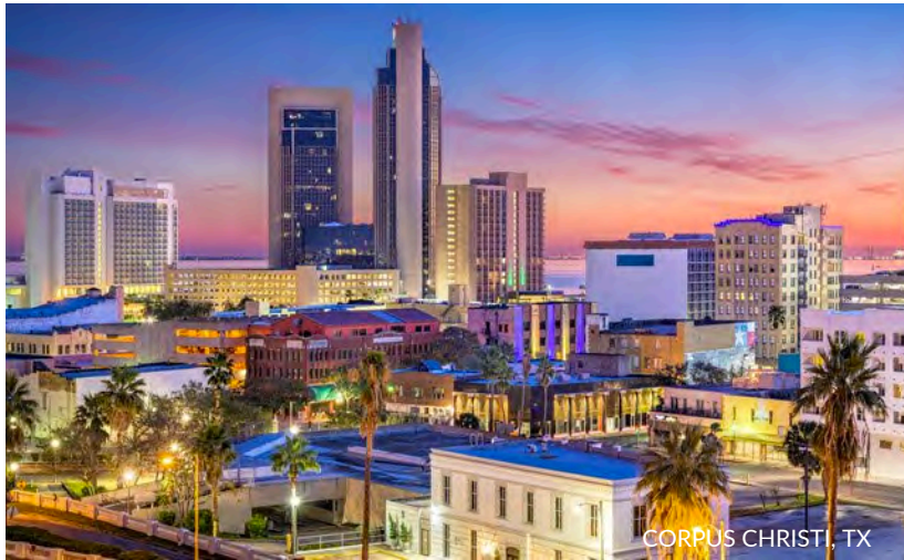
CORPUS CHRISTI, TX