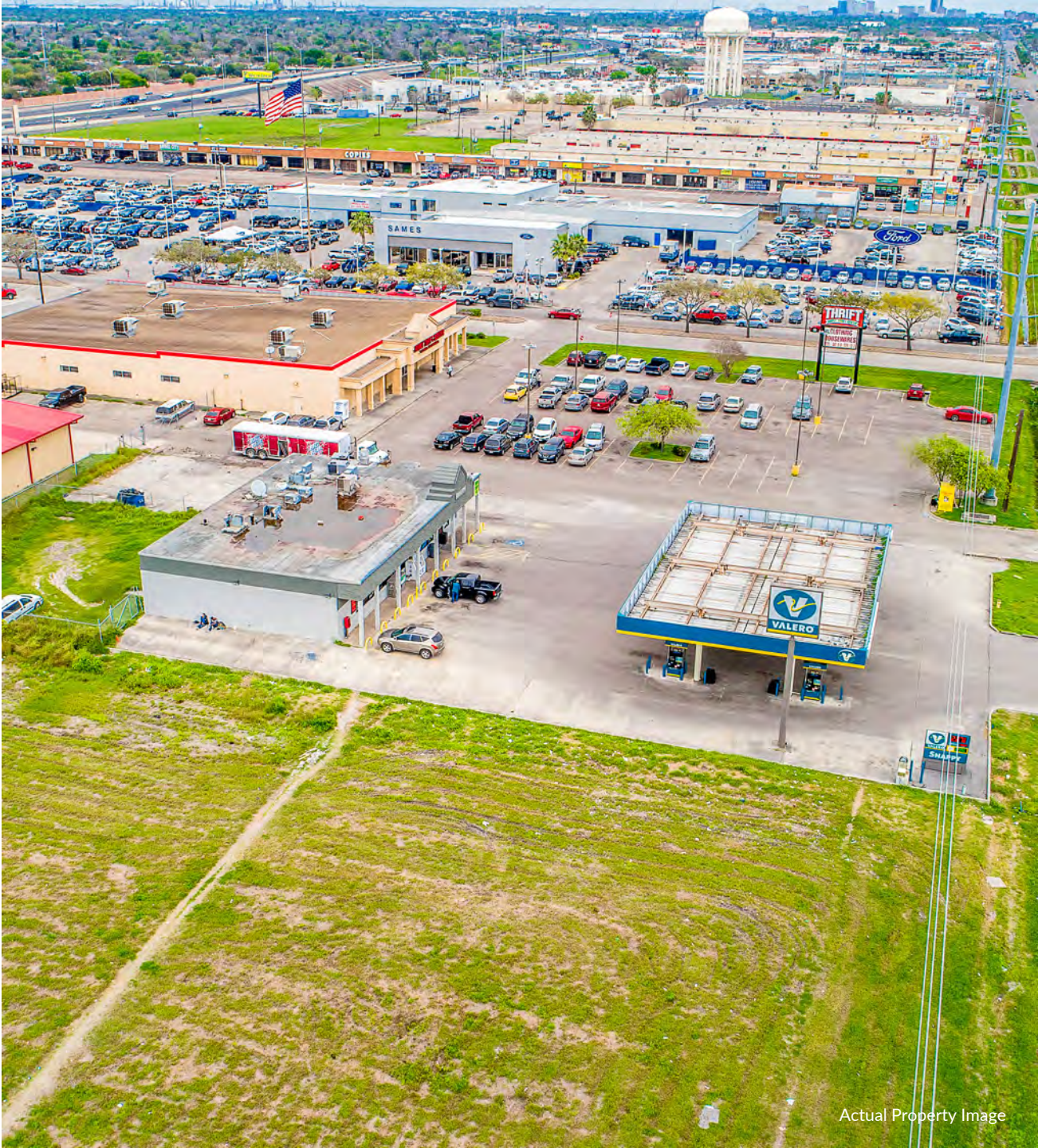
Actual Property Image