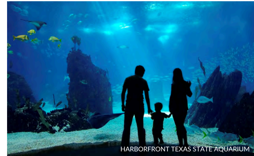
HARBORFRONT TEXAS STATE AQUARIUM

The majority works in wholesale and retail trades, and government sectors. The Port of Corpus Christi is the fifth-largest U.S. port and deepest inshore port on the Gulf of Mexico; it handles mostly oil and agricultural products. Much of the local economy is driven by tourism and the oil and petrochemicals industry. Corpus Christi is also home to the Naval Air Station Corpus Christi providing 6,200 civilian jobs to the local economy, making it the single largest employer in the city. The city is also home to the Corpus Christi Army Depot, which is the largest helicopter repair facility in the world.