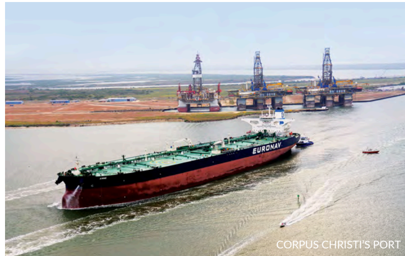
CORPUS CHRISTI'S PORT

Corpus Christi is a coastal city in the South Texas region. The city is also the county seat of Nueces County, but its area extends into Aransas, Kieberg, and San Patricio Counties. The city's population was estimated to be 325,605 in 2017, making it the eighth-most populous city in Texas. The Corpus Christi metropolitan area has an estimated population of 442,600 residents. The city is home to the Port of Corpus Christi, which is the fifth-largest in the United States. The nickname of the city is "Sparkling City by the Sea", due to its location on the gulf of Mexico.