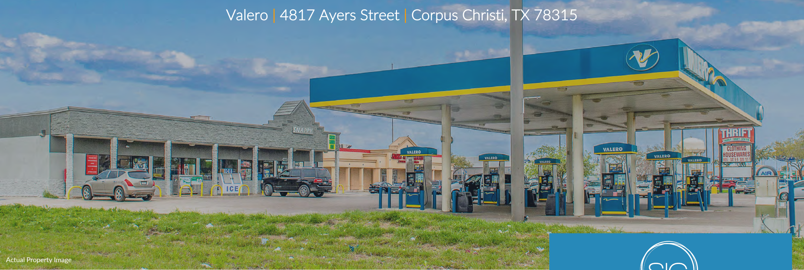
Actual Property Image

Valero | 4817 Ayers Street | Corpus Christi, TX 78315