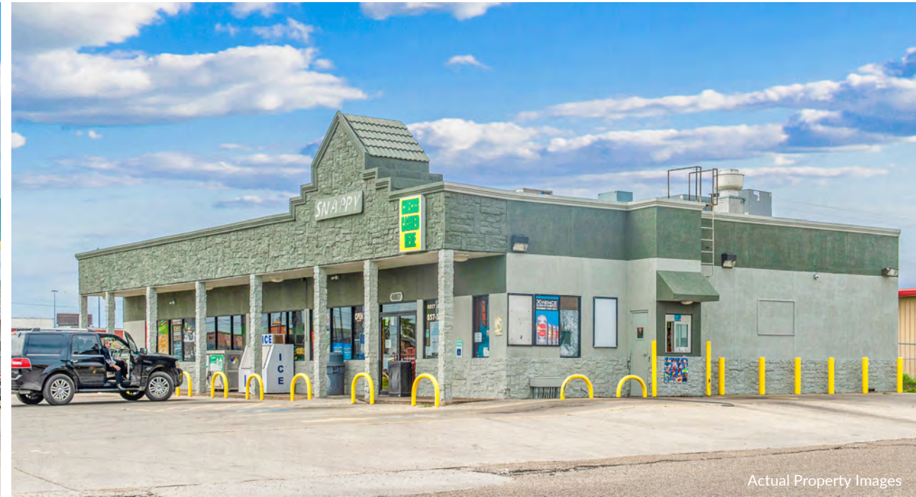
Actual Property Images