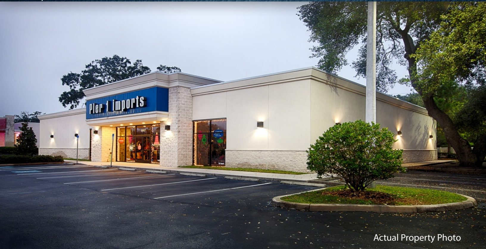
Actual Property Photo

TIKTIN — Real Estate — INVESTMENT SERVICES