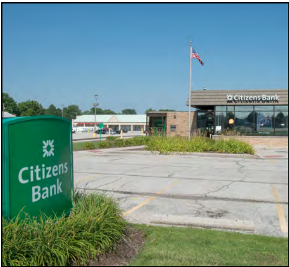
*Actual Location Photos