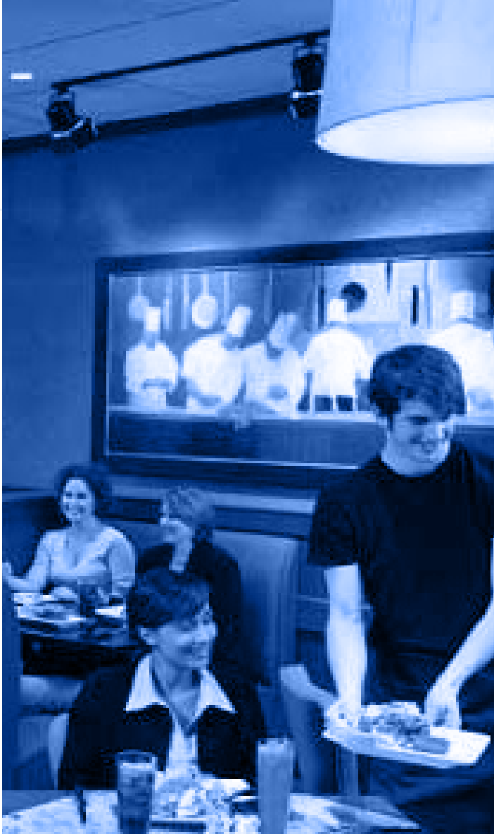
TABLE OF CONTENTS IK