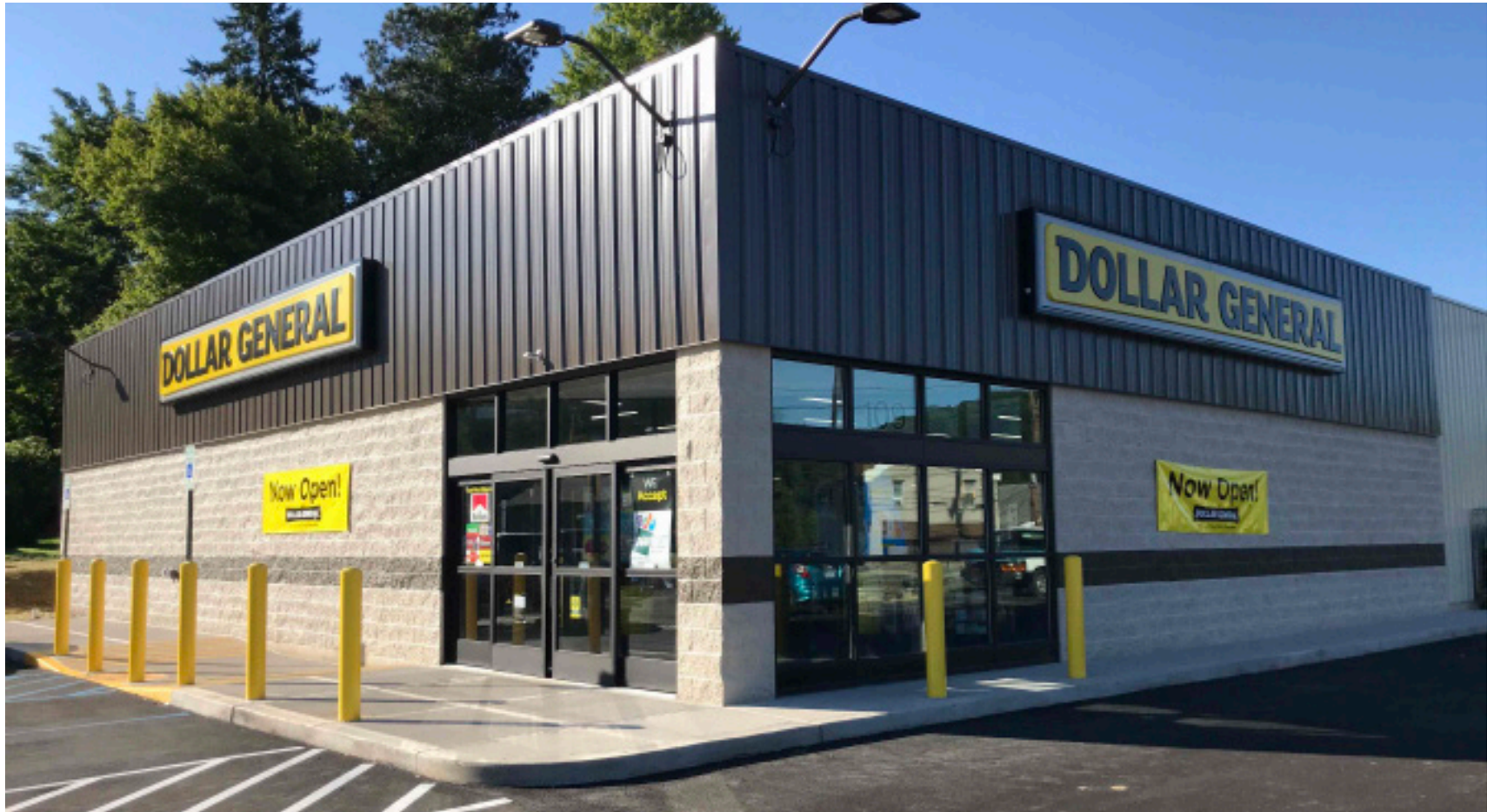
Dollar General 109 Petrolia Street, Karns City, PA 16041