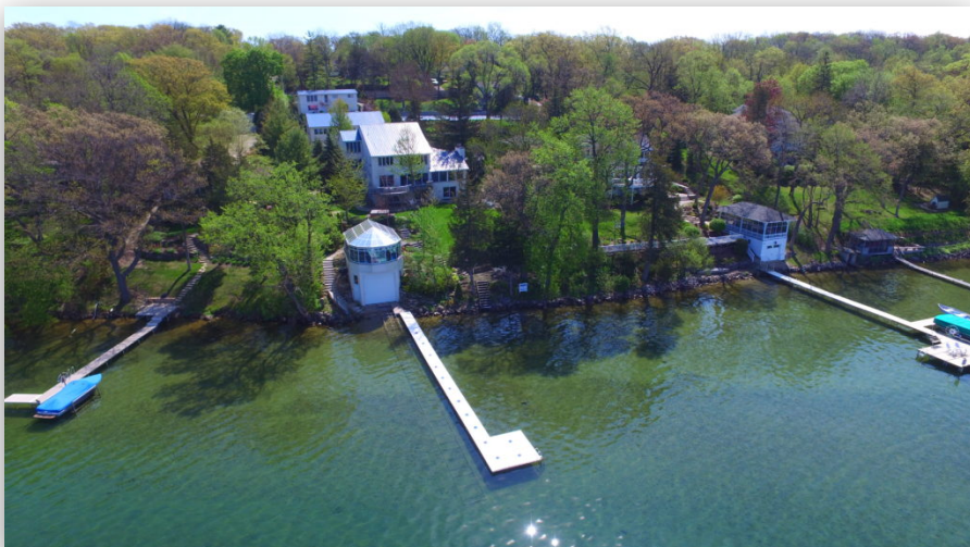
Twin Lakes Homes

The village is home to 6,041 permanent residents with a third more spending part of the year in town. The village continues to grow at a steady pace and estimated to reach 9,980 population by 2023 within a 3-mile radius.