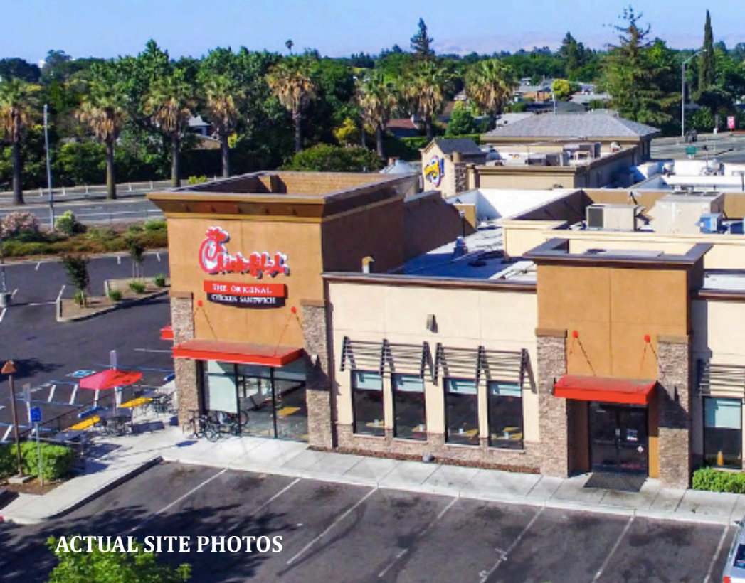
ACTUAL SITE PHOTOS