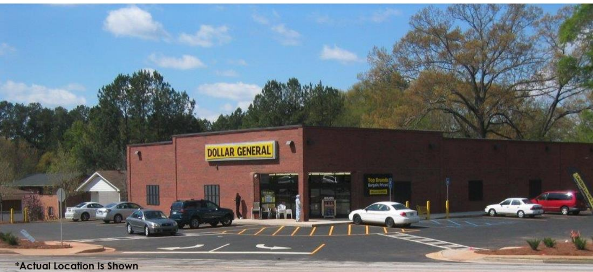
*Actual Location Is Shown