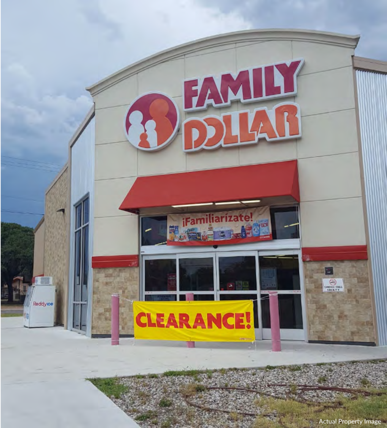
Actual Property Image