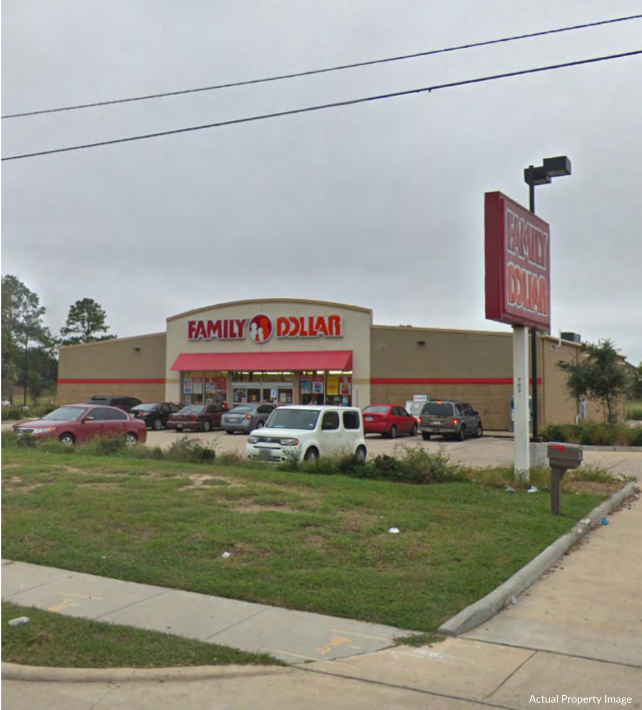
Actual Property Image