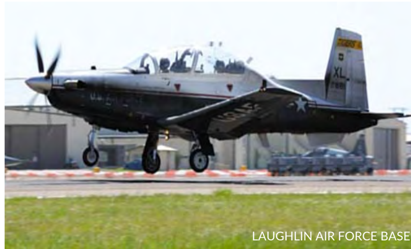
LAUGHLIN AIR FORCE BASE

Del Rio is the county seat of Val Verde County in the state of Texas. As of 2017, the city's estimate population is about 36,006 residents. Val Verde's county population, as a whole, has about 49,205 residents. The city is located 152 miles west of San Antonio. Del Rio is connected to Ciudad Acuna by the Lake Amistad Dam International Crossing and Del Rio-Ciudad Acuna International Bridge. The city is also the home to the Laughlin Air Force Base, which is the busiest United States Air Force pilot-training complex in the world.