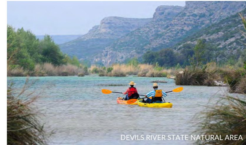
DEVILS RIVER STATE NATURAL AREA

Laughlin plays a large part in the Del Rio community as the area's largest employer. The United States Border Patrol is the city's second-largest employer (with two large stations along with the sector headquarters). Since the base has unused land, the Air Force is able to lease it to other federal law enforcement agencies for projects. This benefits Laughlin AFB and the city of Del Rio both financially and economically. Del Rio is also one of five cities in the whole United States to be selected to have an FBI regional headquarters office.