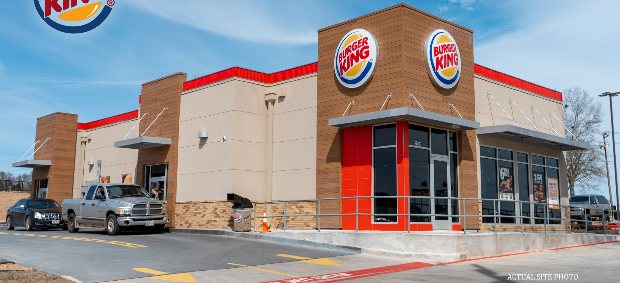
ACTUAL SITE PHOTO