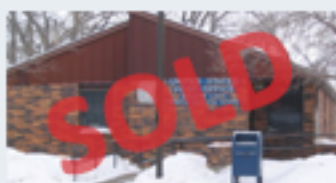
WILLOW LAKE, SD

PRICE: $185,706 CAP: 7.50% NOI: $13,927.92 LEASE TERM RMNG: 4 years