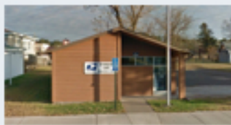
STURGEON LAKE, MN

PRICE: $234,667 CAP: 7.50% NOI: $17,600.00 LEASE TERM RMNG: 5 1/2 years