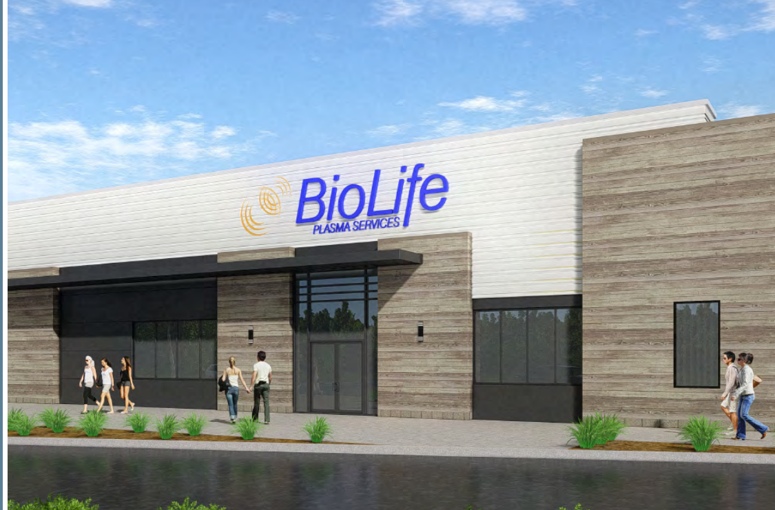
Subject Property Rendering

Click Here for Website & Full Offering Memorandum